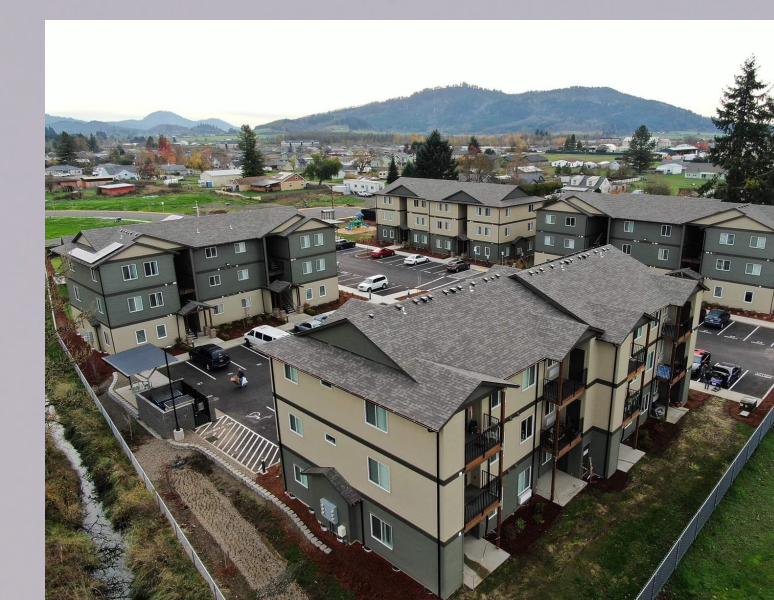
Affordable Housing Units at Applegate Landing